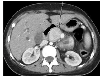
Figure 1: Prechemotherapy contrast-enhanced computed tomography scan showing, enhancing mass in the head of pancreas causing dilatation of the pancreatic duct, Common bile duct and the intra hepatic biliary tree

She was asymptomatic and her disease was under control until April 2011 when she developed nausea, vomiting and rapidly progressive jaundice. On investigating, the serum(S) bilirubin levels were 34 mg/dl with predominant direct-bilirubinemia, S transaminases (serum glutamic oxaloacetic transaminase/serum glutamic pyruvic transaminase) levels were 238/100 units/liter and S alkaline phosphatase was 1440 units/l. Contrast-enhanced computed tomography (CECT) scan demonstrated an irregular hypodense mass located at the head of the pancreas with dilatation of the common-bile-duct and intrahepatic-bile-ducts;